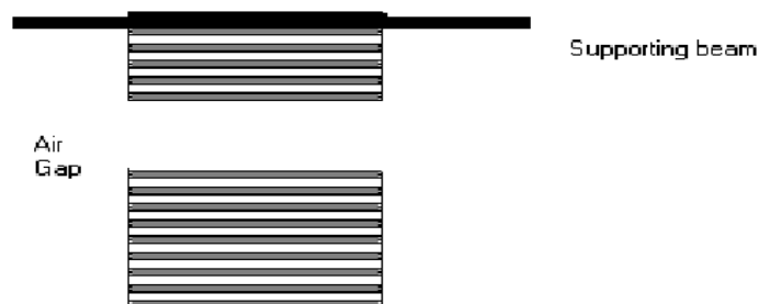
Figure 1. The Si/SiO 2 tunable PBG device with large air gap.

The schematic illustration of the tunable PBG device is shown in Fig.1. We emphasize that, a) the whole process is CMOS compatible. b) low temperature process is preserved. Low temperature process reduces the film stress significantly, which is critical for the optical properties and polymer based materials can be incorporated into the process. Starting with (100) Si substrate (about 500um in thickness), the SiO 2 layer is deposited by Plasma Enhanced Chemical Vapor Deposition (PECVD). Silicon layer is formed via e-beam deposition. After deposition of first several SiO 2 /Si pair layers, followed by another oxide layer by PECVD, Polyimide (PI) film is spin coated at various speed for different PI thickness, after postbake, PI film is sent to the furnace for cure at relatively high temperature. Careful treatment is necessary to keep the surface flat, which is important for the final performance. Another oxide film is deposited on the top of PI film via PECVD, followed by several top SiO 2 /Si pair layers. Then supporting membranes films are deposited at low temperature. Lithography is utilized to pattern the structure and form the air gap by ashing the PI layer at selected areas.